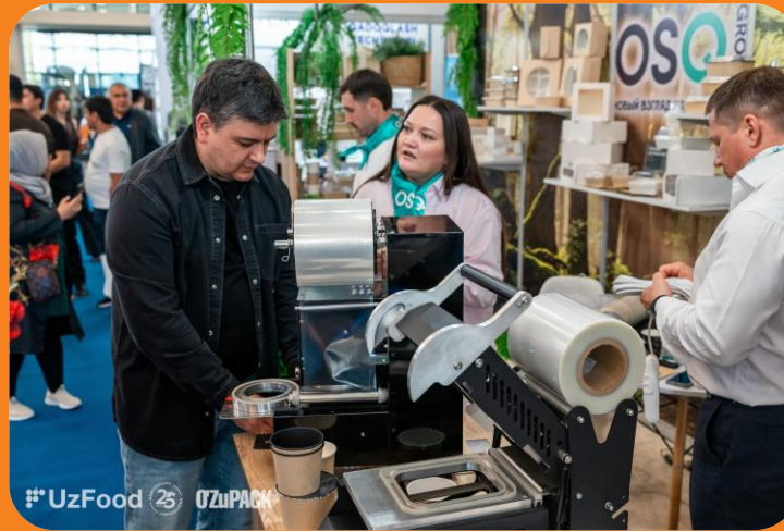
Pavilion 2 Meat Processing, Dairy, Bakery, and Food Equipment